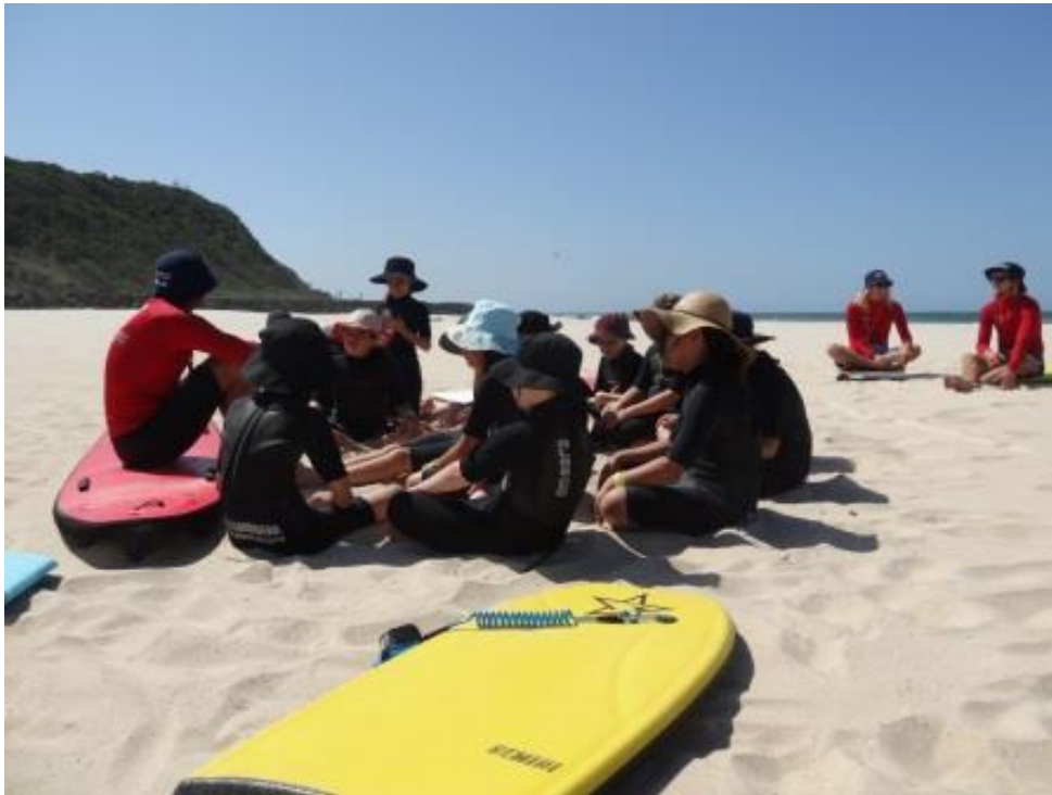
YEAR 4 CAMP